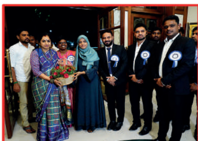
DR. THAMIZHACHI THANGAPANDIAN, DMK - MEMBER OF PARLIAMENT SOUTH CHENNAI